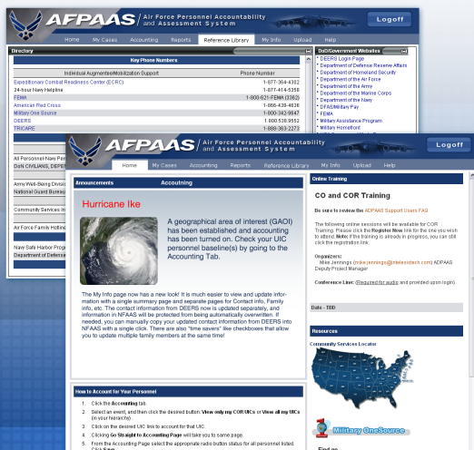
AFPAAS Home Page and Reference Library