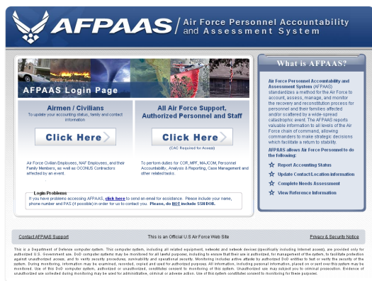
AFPAAS Start Page